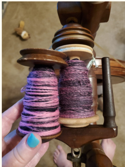
Singles spun from fiber blended at Convergence Blended and spun by Donna